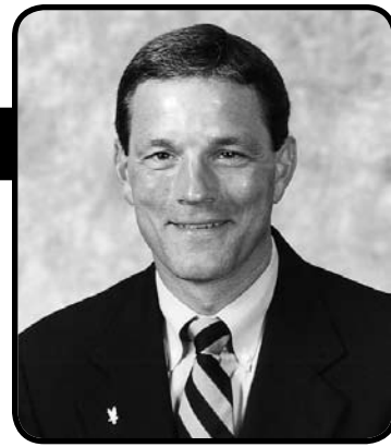
Head Coach Kirk Ferentz